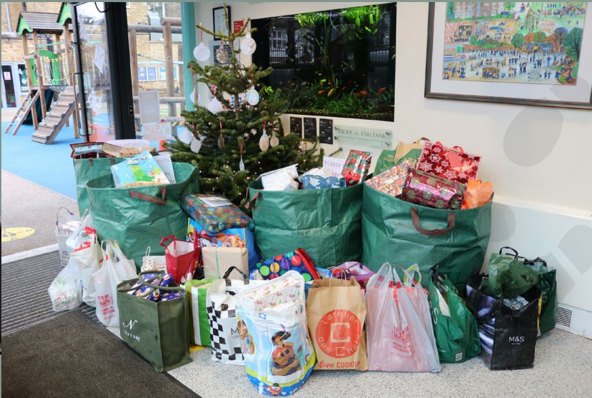
December 2020 – supporting the annual ‘Give Joy, Give a Toy’ fundraiser’